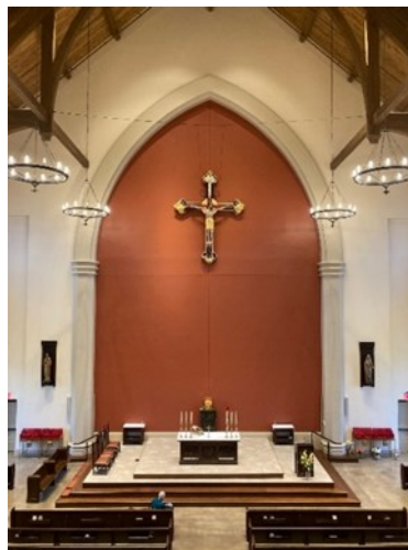
Temporary terra cotta wall pending extending the nave