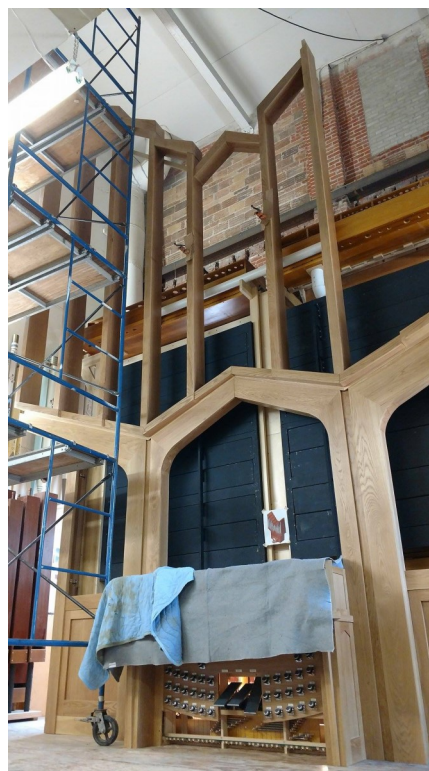
Case construction in the Redman shop