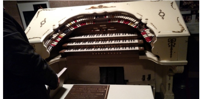
Photograph of the Wurlitzer currently housed in Casa Mañana

that were built that remain in original condition. In addition, there is the consideration that there is not currently another playable theater organ in the Dallas-Fort Worth area. We also visited Will Rogers Auditorium and determined that there is plenty of space for the organ to be installed there. If restored we would not only be preserving an historical Fort Worth icon, but would be making available a viable theater organ in our area. It could be a great musical experience for all. I invite your questions and suggestions as to how we might move forward to make this happen.