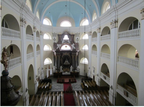
Jesus Church, Cieszyn, Poland

As organists, we owe a great deal to Martin Luther, that brave and steadfast monk who had the gall to publicly question the excesses of the Roman Catholic Church to the point of ridicule and excommunication. Thanks to his bravery and persistence, we can now enjoy the beauty of the four-part chorales which became the hallmark of the Lutheran service. And of course, these sturdy, strophic chorales are the basis for a wealth of highly artistic chorale fantasias and chorale preludes by devout and enthusiastic Lutherans such as Johann