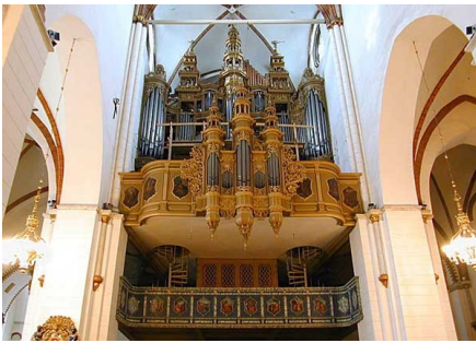
19th Century Walcker Organ Riga Cathedral