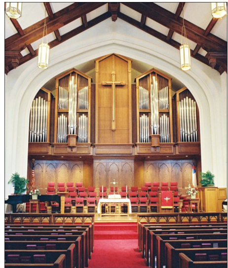
First United Methodist Church Odessa, TX

Service: An organ should be serviced and tuned once a year at a minimum.