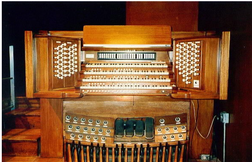
The organ in Ed Landreth Auditorium