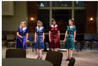
The Singing Pummill Sisters perform after the opening service at First Presbyterian Church