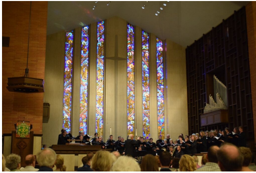
The opening worship service at First Presbyterian Church