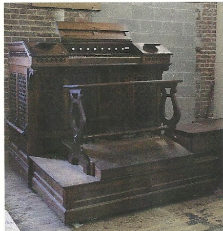
Louis Debierre 1884, Completely restored, Many amazing features