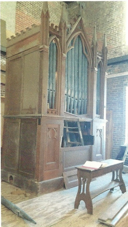
C1860 Pfeiffer, Two Manual and Pedal, 7 stops, to be restored