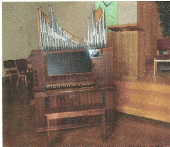
Four Stop portable Organ, Move in a minivan