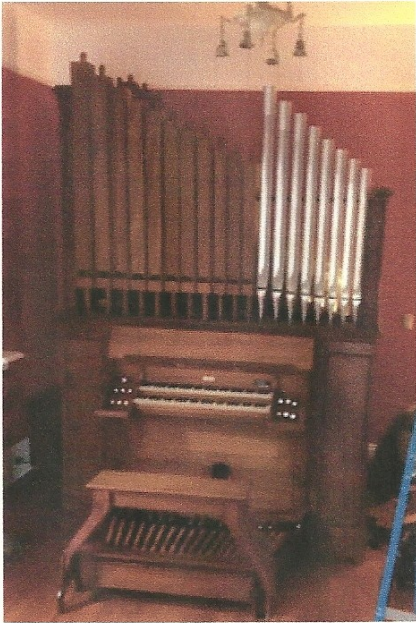
Nine Stop Hook and Hastings with some new pipework and completely renovated.