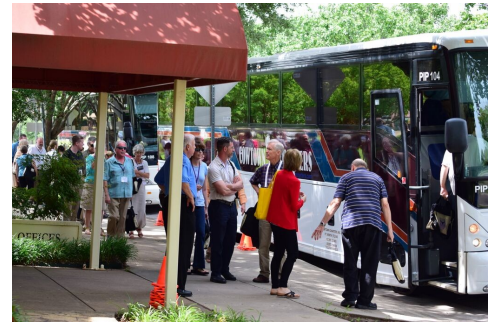
Convention attendees board buses